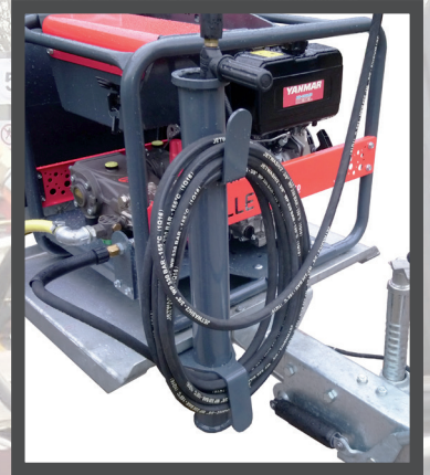
LANCE HOLDER INTEGRATED INTO THE TRAILER WITH HOSE STORAGE HOOKS