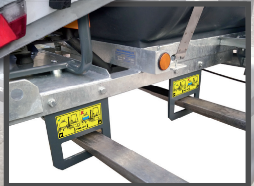
FORKLIFT POINTS FOR SAFE ON-SITE TRANSPORTATION