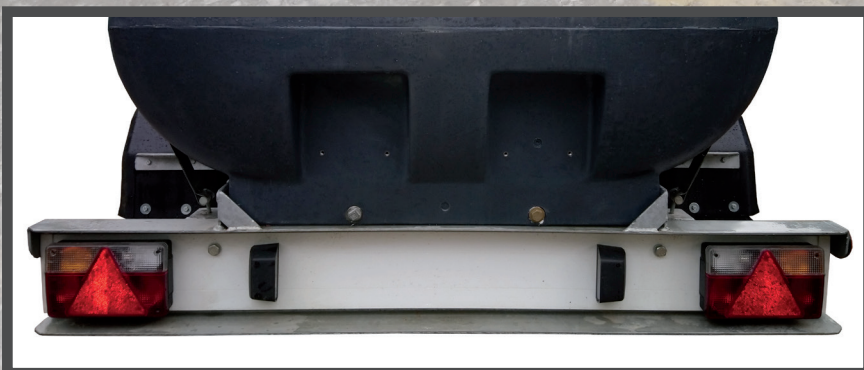
INTEGRATED LIGHTING EQUIPMENT COMPLETE WITH 13-PIN PLUG AND 7-PIN ADAPTOR