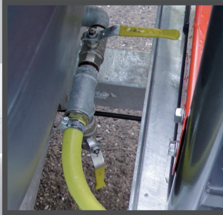
TANK AND PUMP DRAIN TAPS FOR SAFE TRANSPORTATION & PREVENT FROST DAMAGE