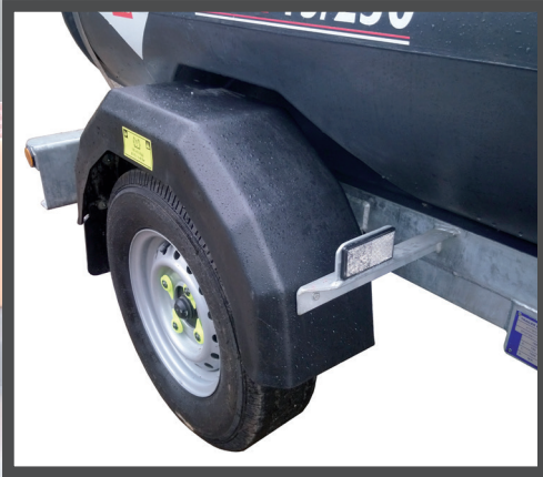
MOULDED MUDGUARDS, SIDE REFLECTORS & WHEEL NUT INDICATORS