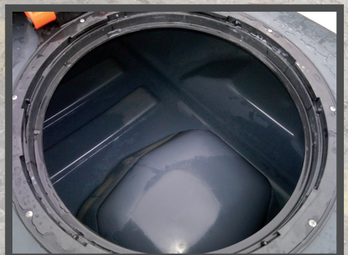
GENEROUS 550MM TANK MOUTH & INTERNAL TANK BAFFLE