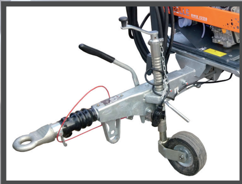
40MM TOWING EYE, BREAK-AWAY CABLE & TELESCOPIC JOCKEY WHEEL / JACK (OPTIONAL 50MM BALL HITCH ALSO AVAILABLE)